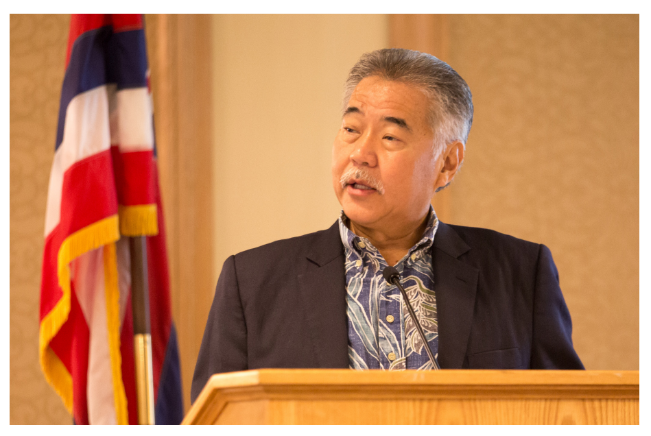
Hawai'i Governor David Ige launched the Biosecurity and Invasive Species Initiative as his central policy effort as WGA Chair.

The workshops were followed by webinars that examined discrete issues surrounding invasive species management and control. Webinars examined several topics, including the effects of invasive species on fisheries, the role of conservation districts in invasive species management, and impacts of invasive species on Pacific Islands forests and ecosystems.