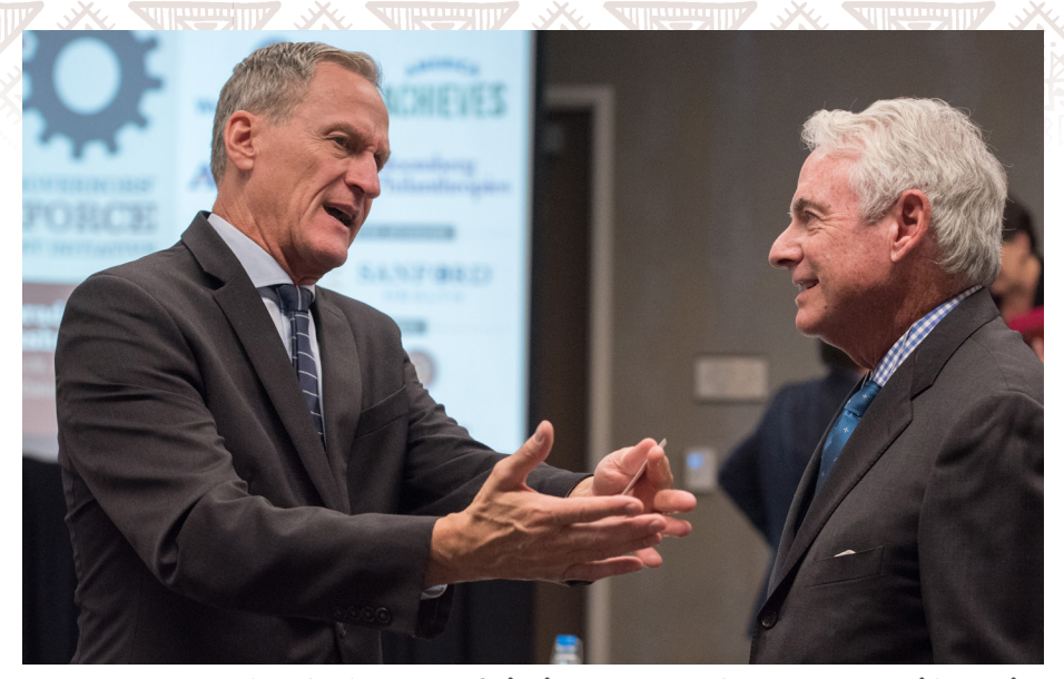
Governor Daugaard took advantage of his time at the workshops to share ideas with attendees.

and state policies, states determine the metrics used to measure school performance and accountability systems and these metrics guide how teachers and school administrators prioritize their time and resources. States have historically used metrics such as test scores and graduation rates, which are indicators of college readiness. Many states are now adding school performance measures that reflect students' successful transition to more types of postsecondary education and training. Accounting for all pathways helps school districts and teachers to encourage students to more purposefully pursue all types of in-demand postsecondary credentials. States can also include jobs outcomes as key metrics for postsecondary education and training programs and provide the public with information on jobs and earnings outcomes by program and institution.