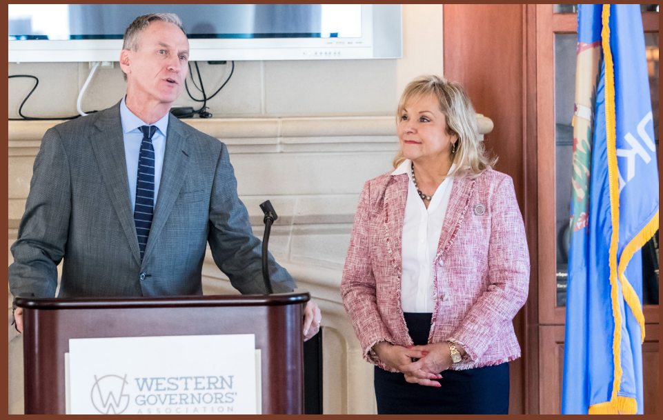
"Every governor is aware of and struggles with the workforce gap," said Governor Daugaard during a press conference with Governor Fallin.

Gov. Fallin also discussed the workforce efforts that she has launched as governor, including "Oklahoma Works." That initiative connects businesses, state agencies and educators to discuss what skills employers need and how educational leaders can better align degree programs to better achieve that employee pipeline.