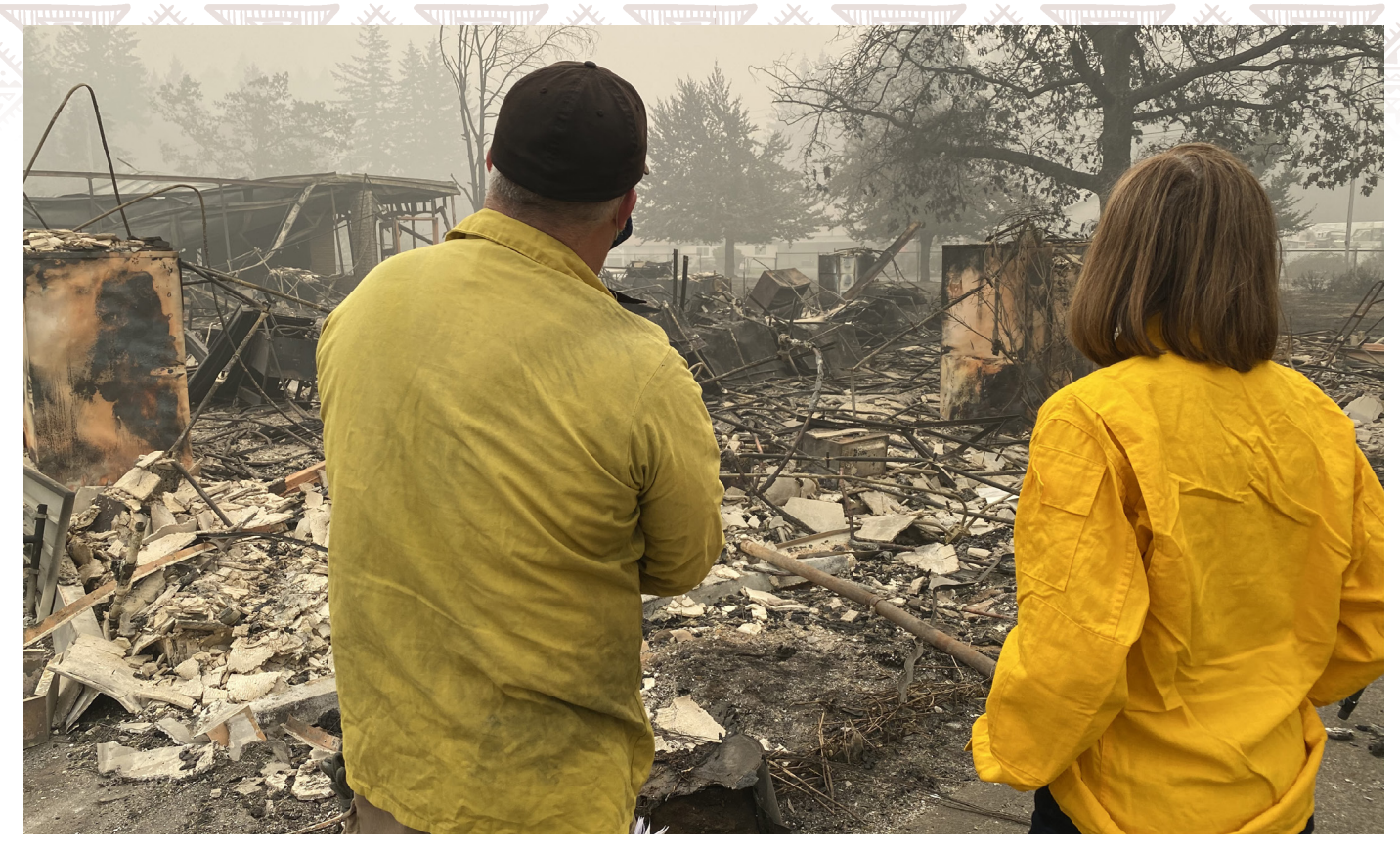
Like many western governors, Oregon Gov. Kate Brown, shown surveying the destruction of the Beachie Creek Fire in September 2020, had to respond to the twin challenges of wildfires and the pandemic.