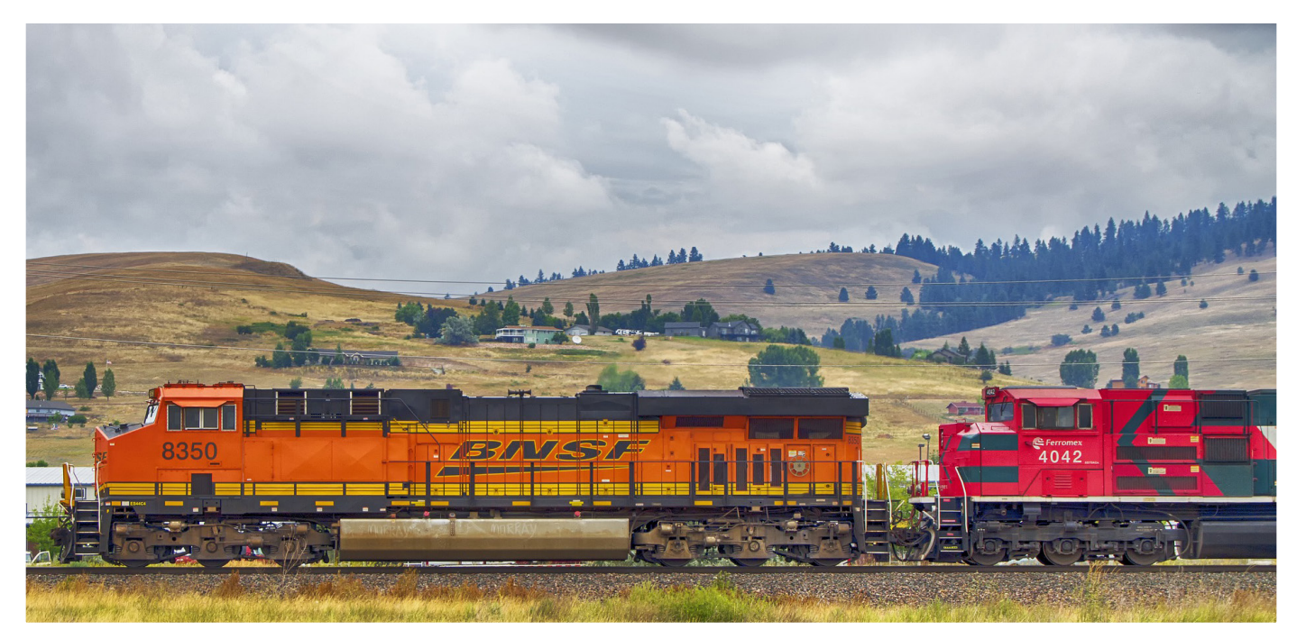
Transportation infrastructure in the West moves agricultural and natural resource products from source to national and world markets.

Western Governors enact new policy resolutions and amend existing resolutions on a semiannual basis. All of WGA's current resolutions may be found at westgov.org/resolutions/