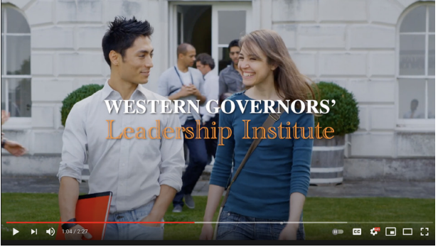
The Leadership Institute was launched at the Annual Meeting.