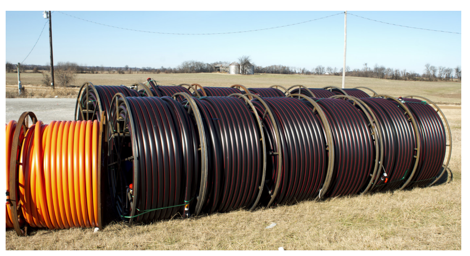
Western Governors' advocacy aims to increase access to high-speed broadband across the region, particularly in rural areas.

Telecommunications and Information Administration addressed the Governors' recommendations by establishing a $1 billion grant program for tribes, funded by COVID-19 relief provisions. The grants will be directed to Tribal governments for broadband deployment, telehealth, distance learning, broadband affordability, and digital inclusion.