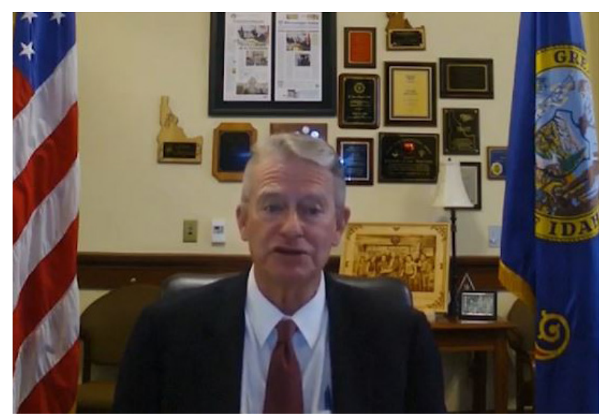
Idaho Gov. Brad Little spoke at the virtual forum, "Local Groups in Land Management."

The Governor's remarks were followed by a discussion with representatives of the Western Landowners Alliance, The Nature Conservancy, and Colorado Counties. They shared examples of effective cross boundary management and discussed the role that the Working Lands Roundtable plays in their work on western policy issues.