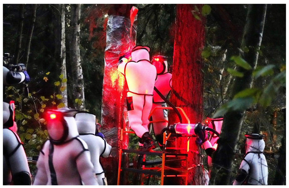
The state of Washington's Department of Agriculture removed a nest of invasive Asian Giant Hornets in October, 2020.

The toolkit, which addresses the largescale infestation of invasive grasses on western forests and rangelands, is an outgrowth of the collaborative work