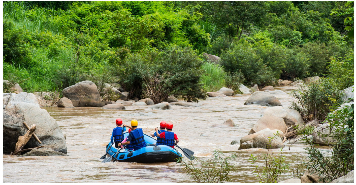
The Governors seek to collaborate with the Administration on its "America the Beautiful" proposal.

Learn more about the new policy resolutions National Forest and Rangeland Management and Wild Horse and Burro Management on page 19.