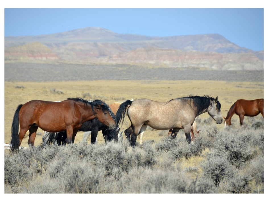
Western Governors support thoughtful and science-based herd management decisions for wild horses and burros.

WGA Policy Resolution 2021-03, National Forest and Rangeland Management: This resolution renews