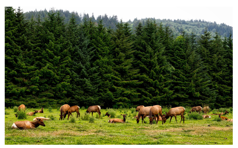
Chronic Wasting Disease presents an enormous danger to deer, elk, moose, reindeer.

In WGA Policy Resolution 2020-01, Strengthening the State-Federal Relationship, Western Governors emphasize that states are co-sovereigns with the federal government. In the case of fish and wildlife management, states have primary management responsibility for the majority of the species within their borders. While the federal government