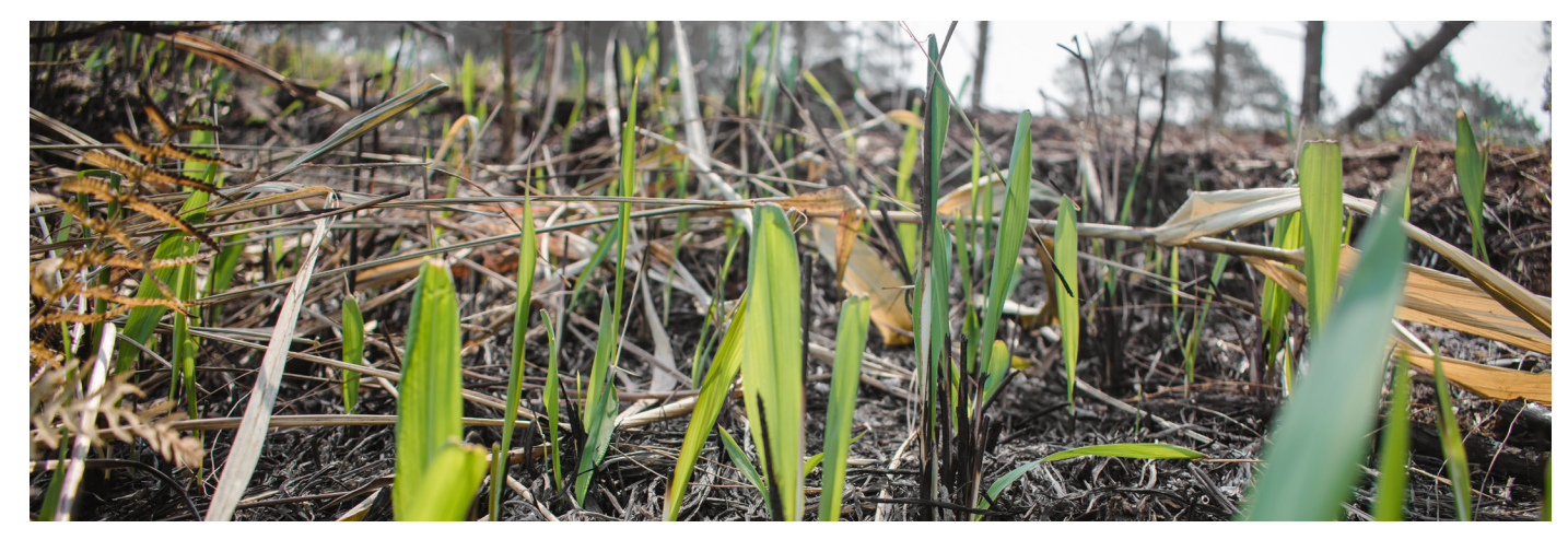
The Governors' want to ensure wildfire restoration activity receives the same priority as mitigation and suppression.